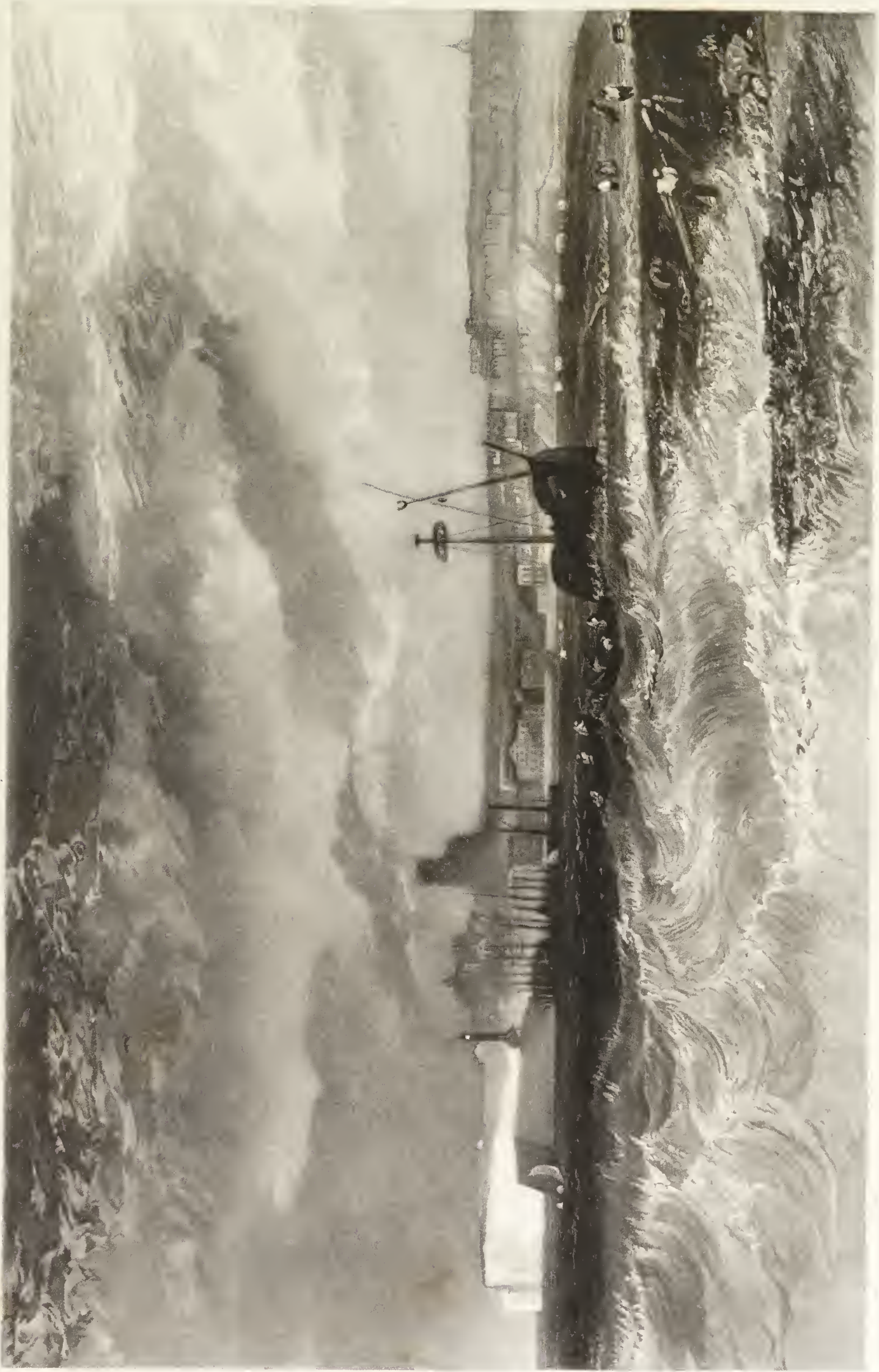
View of the town of ...